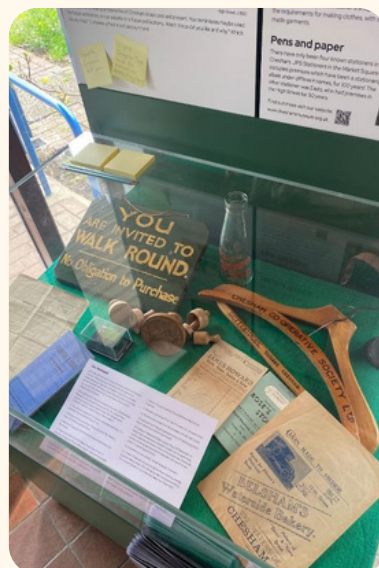
Far right: the display in The Elgiva