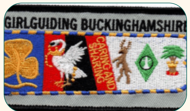
Above: The County Banner

The headquarters is available to all Rainbow, Brownie, Guide & Ranger units in Chesham, as well as being hired by community groups. The Council's donation of £175 has helped the Guide Association reach their funding target, which means that vital work to refurbish the Guide Hut toilets can be in the summer of 2024.