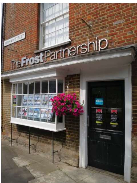
Left: The Frost Partnership with their hanging basket in Germain Street

Blooming Business Competition – stunning displays by local businesses have made a wonderful contribution to the town this year.