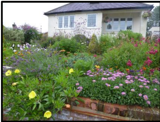
James Smith's garden

Front Garden Competition – We continue to be delighted with the standard of entries into our Front Garden, Container and Hanging Basket competition! Here are some examples of the 2017 entrants: