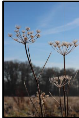
Left: A winter scene by Amy Coleman

Can we cover the UK in pots for pollinators?