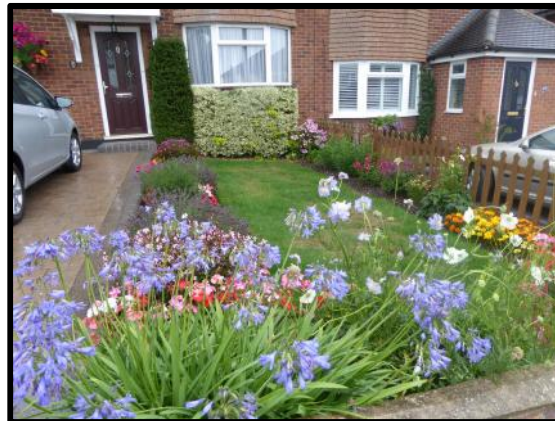
Colin Forward's garden